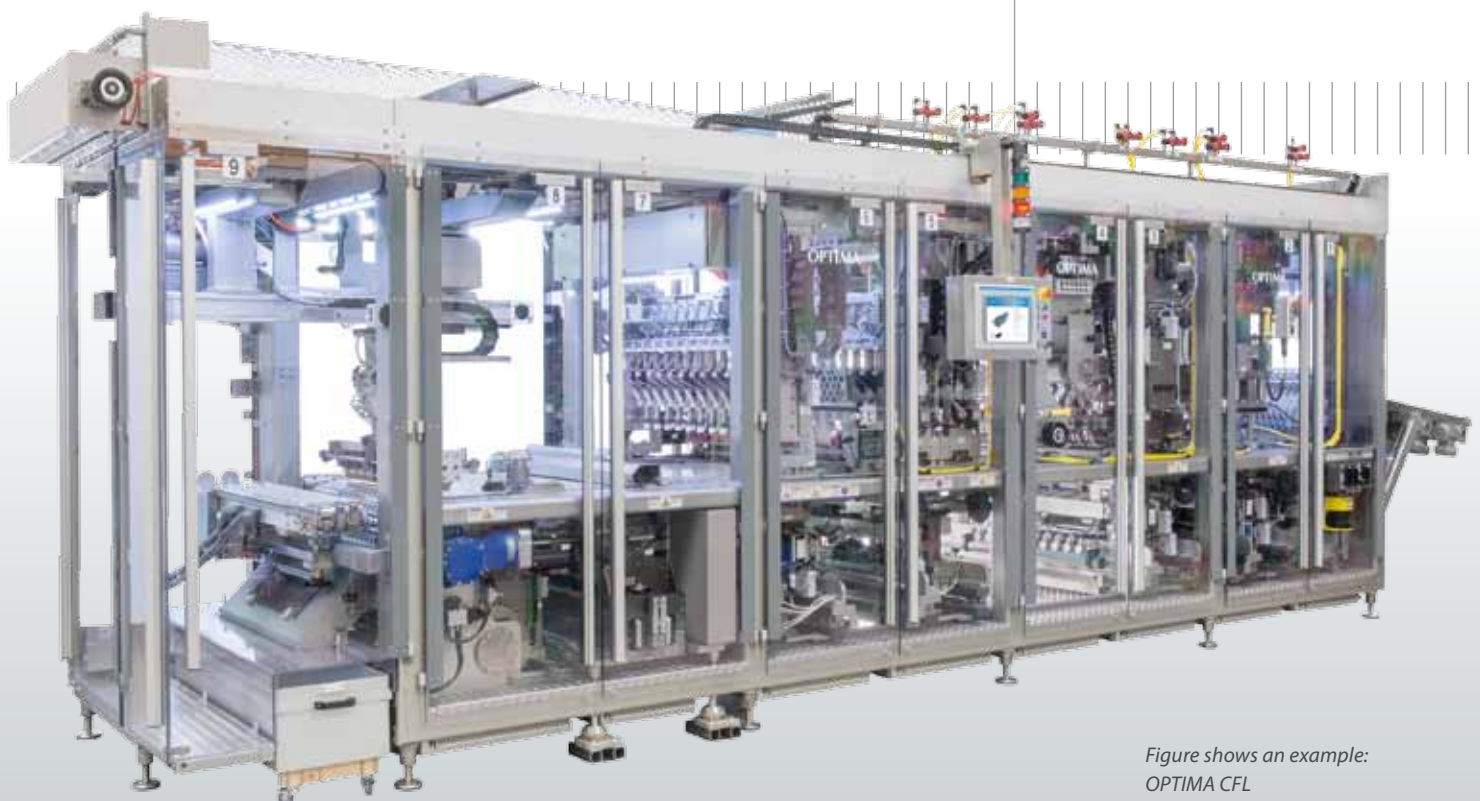
Figure shows an example: OPTIMA CFL