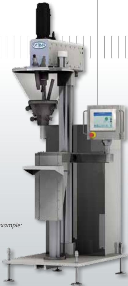
Figure shows an example: OPTIMA SD2