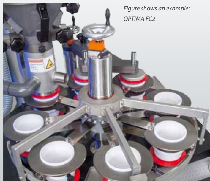
Figure shows an example: OPTIMA FC2