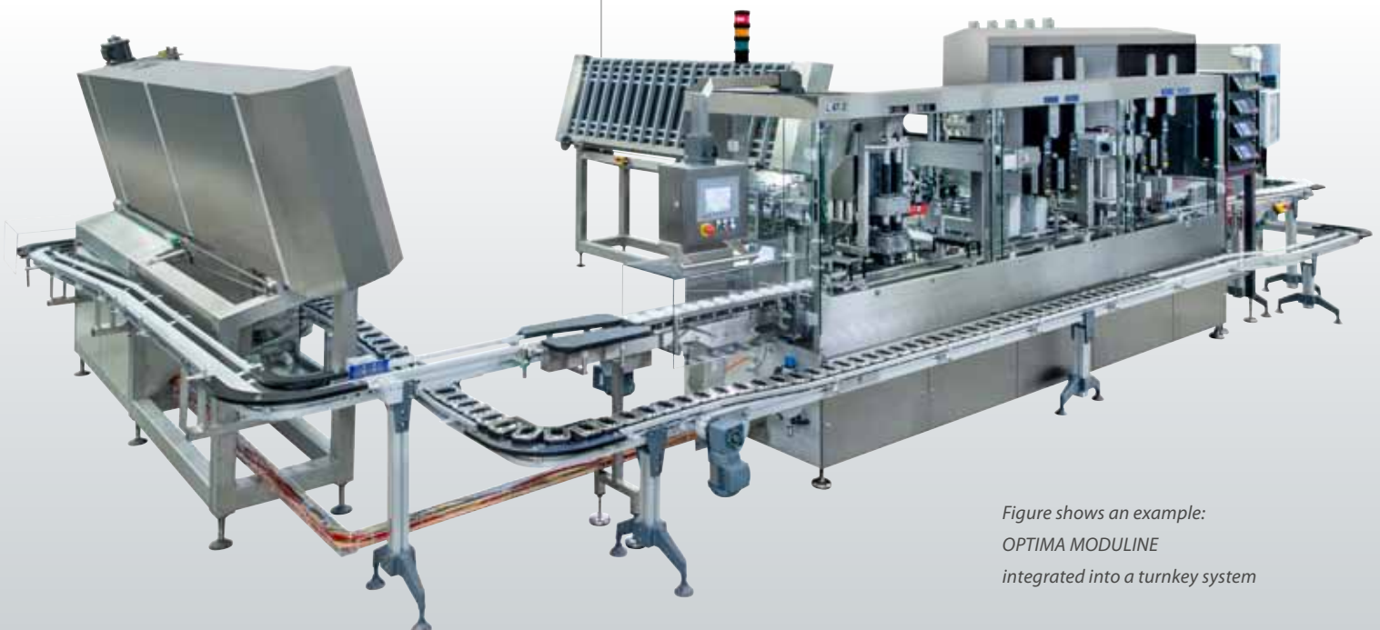
Figure shows an example: OPTIMA MODULINE integrated into a turnkey system